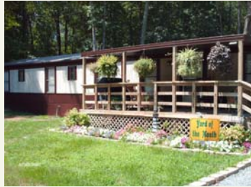
10475 Comanche Lane

Congratulations to the winner of July's Yard of the Month contest. The winner received $30 off their lot rent for having the "Most Improved" yard.