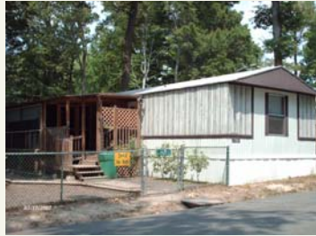
10430 Arapaho Lane

Congratulations to the winner of this month's Yard of the Month contest. The winner will receive $30 off their lot rent for having the "Most Beautiful" yard.